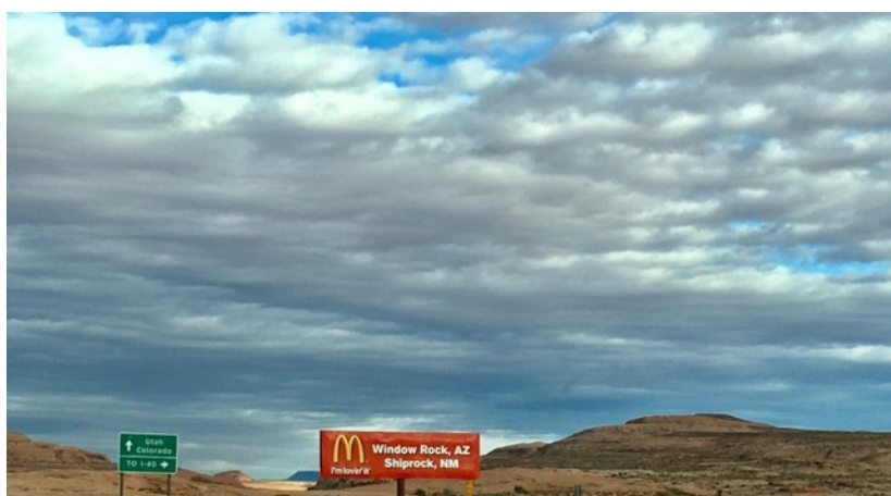
Figure 1: McDonald’s billboard, Shiprock, New Mexico, Navajo Nation.

How advocates frame the issue of target marketing will determine whether the public, policymakers, and even marketers themselves, see the problem.