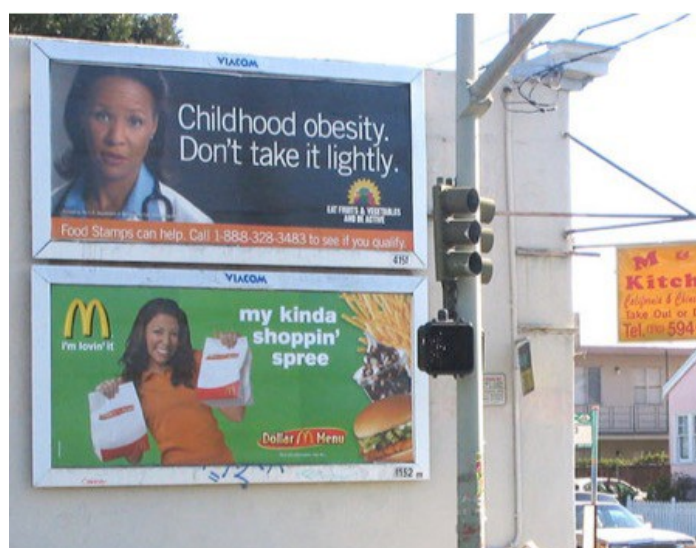
Figure 2: Street corner in Oakland, California, with billboards advertising an obesity prevention campaign above a promotion for McDonald's Dollar Menu.

To find out whether children and youth of color are in the frame when advocates talk about junk food marketing, we reviewed how leading public health advocacy and research organizations describe food and beverage marketing in their research reports, on their websites and in other materials. We found that although ethnically targeted marketing of junk food to children is clearly documented in published research, and many documents address marketing to children in general, few explicitly focus on targeted marketing or include images of children or families of color. Many documents mention health disparities, but most fail to explicitly connect the problem to junk food marketing — or why it is a health equity issue.